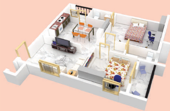
3D Models of 2BHK Flat