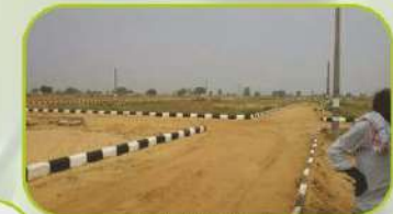
Actual Site Photo