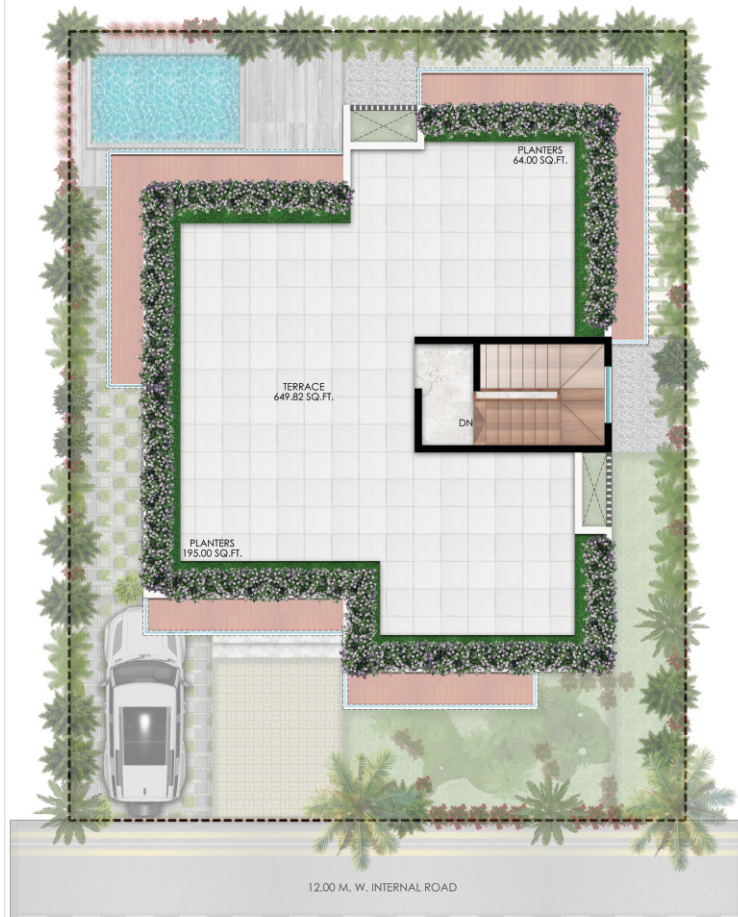
TERRACE FLOOR PLAN ARCHITECTURAL PLANET TRICOLOUR PROPERTIES (P) LTD.