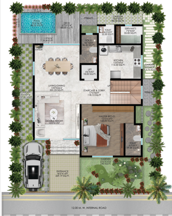
GROUND FLOOR PLAN RCA. 952.41 SQ.FT. ARCHITECTURAL PLANET TRICOLOUR PROPERTIES (P) LTD.